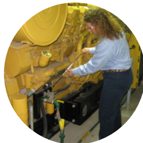
Water & Environmental Technology